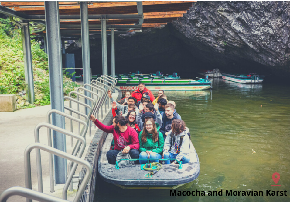
Macocha and Moravian Karst

Experience the great atmosphere at one of the hockey games